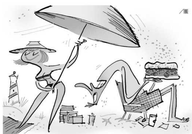
BOB STAAKE FOR THE WASHINGTON POST

Q. What road trip movie features a pair of fugitives debating whether to flee or not to flee?